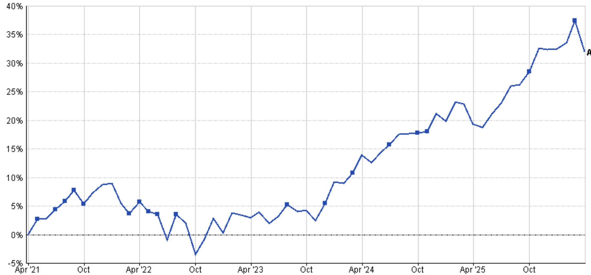
■ A - Daintree WM discretionary Income portfolio 05/03/2026 TR in GB [32.08%]

31/03/2021 - 31/03/2026 Data from FE fundinfo2026