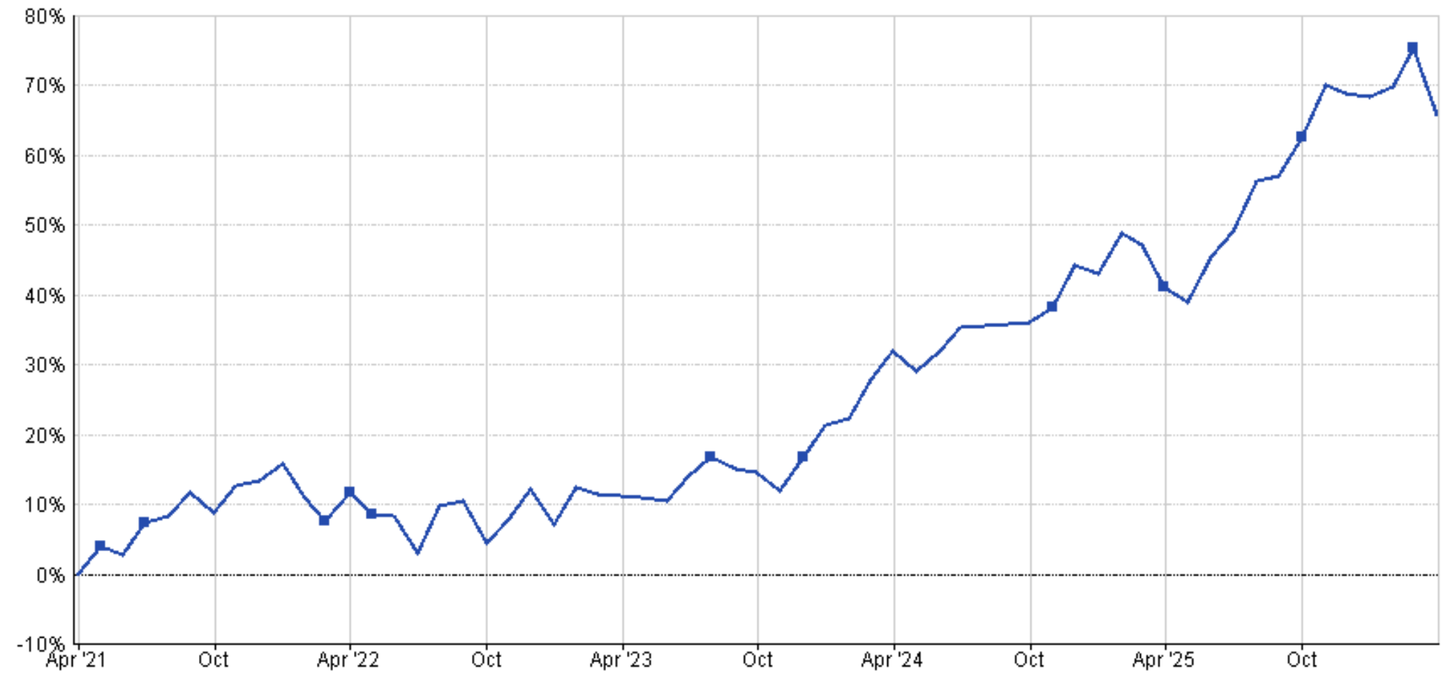
■ A - Daintree WM discretionary Global growth portfolio 05/03/2026 TR in GB [65.75%]

31/03/2021 - 31/03/2026 Data from FE fundinfo2026