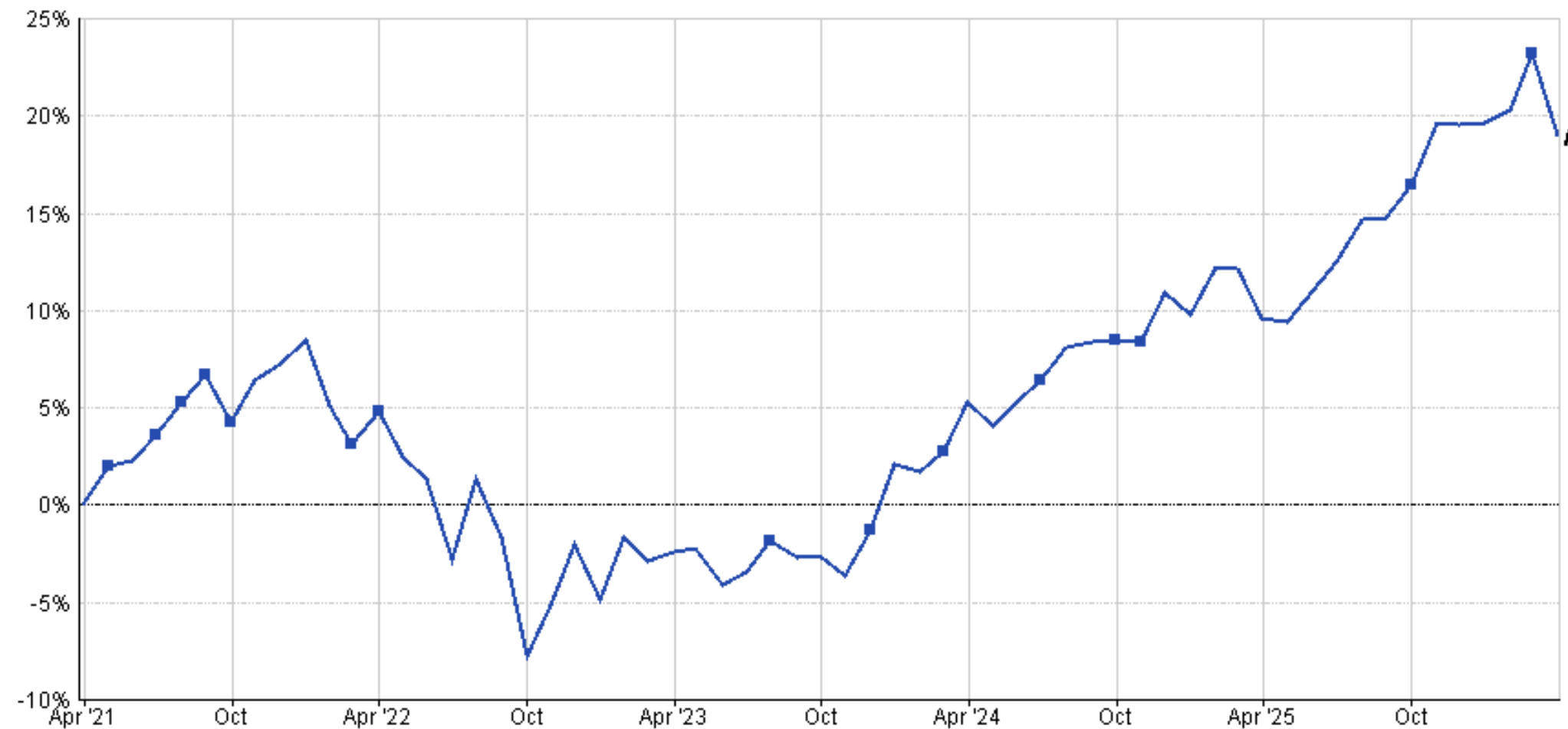
■ A - Daintree WM discretionary Conservative portfolio 05/03/2026 TR in GB [18.99%]

31/03/2021 - 31/03/2026 Data from FE fundinfo2026