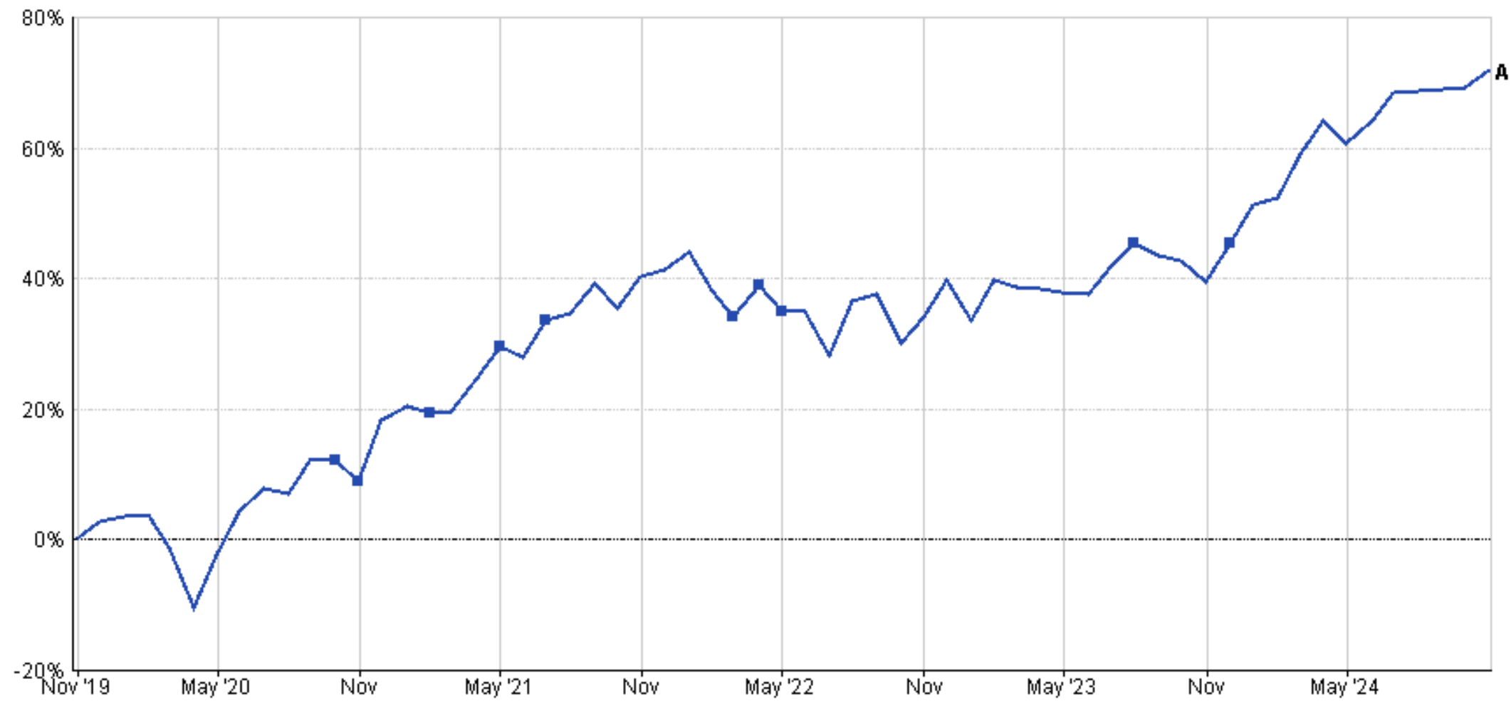
■ A - Daintree WM discretionary Global growth portfolio 18/12/2023 TR in GB (72.02%)

31/10/2019 - 31/10/2024 Data from FE fundinfo 2024