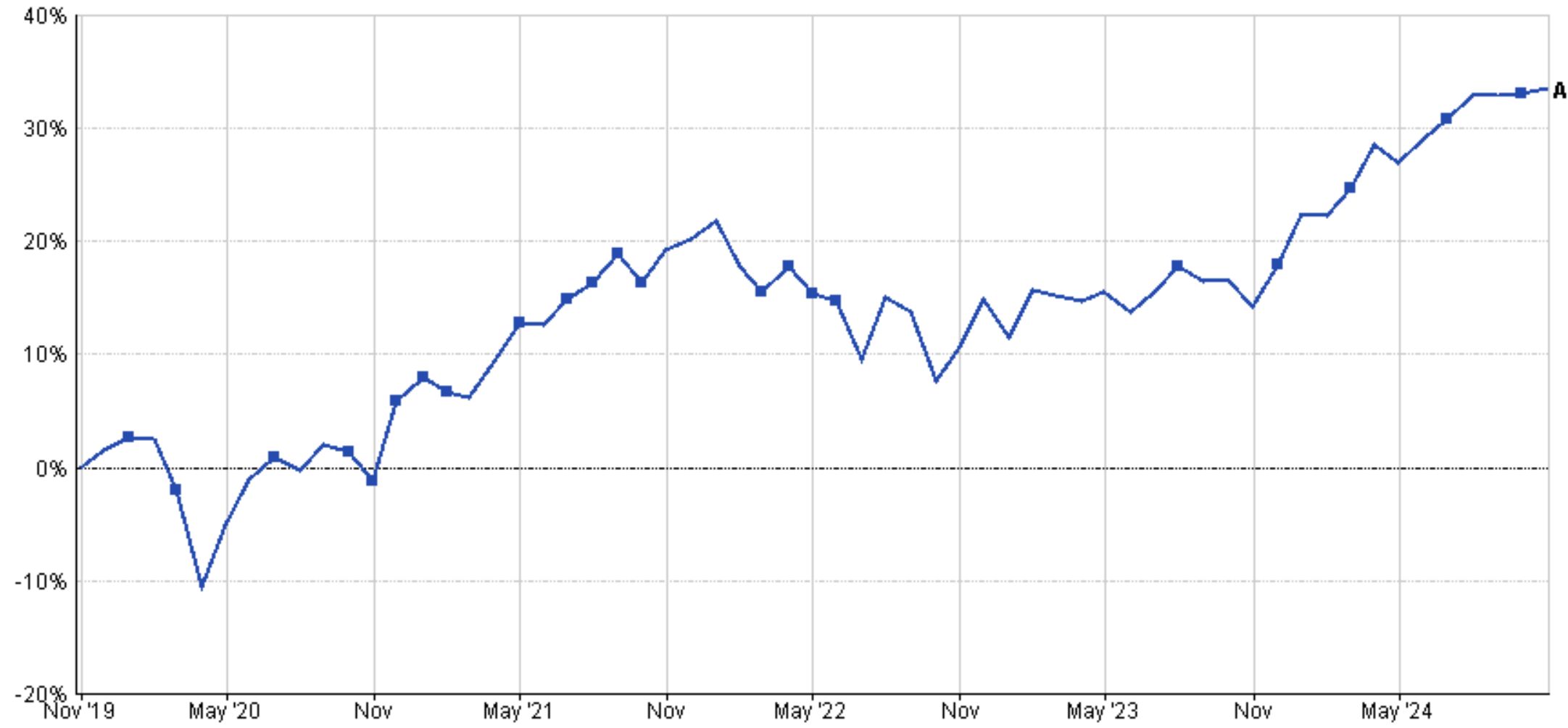
■ A - Daintree WM discretionary Balanced portfolio 30/09/2024 TR in GB [33.57%]

31/10/2019 - 31/10/2024 Data from FE fundinfo2024